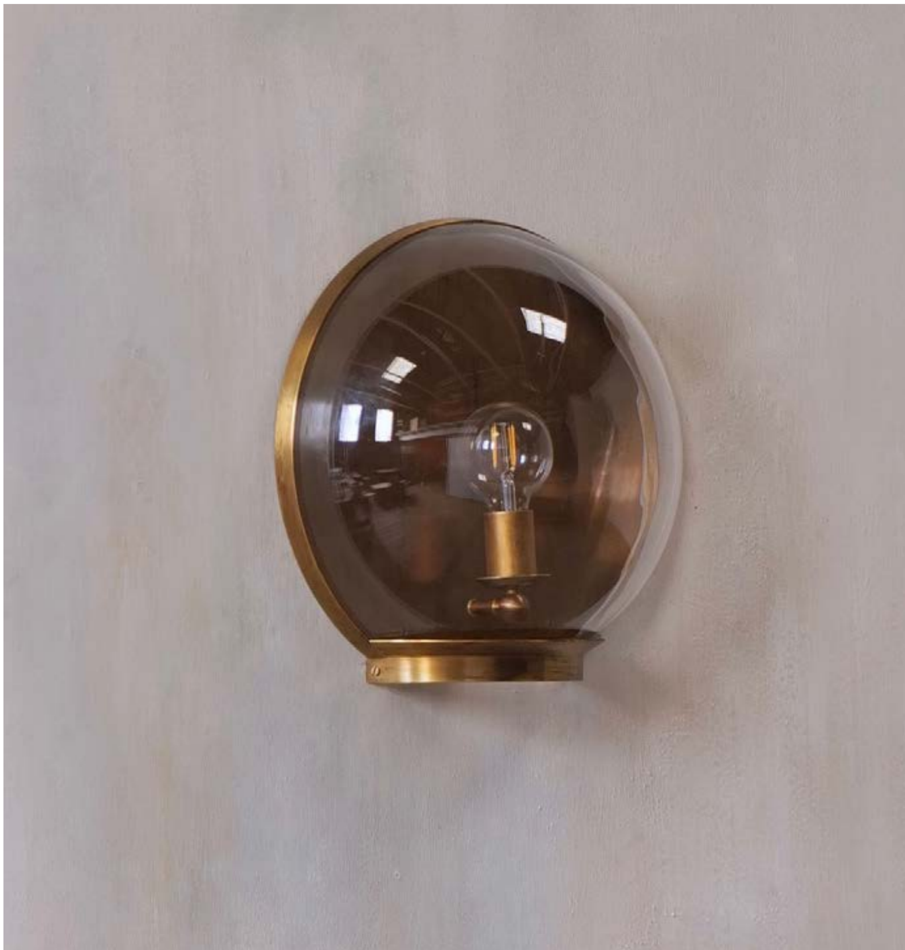
The loupe light in brass | honey